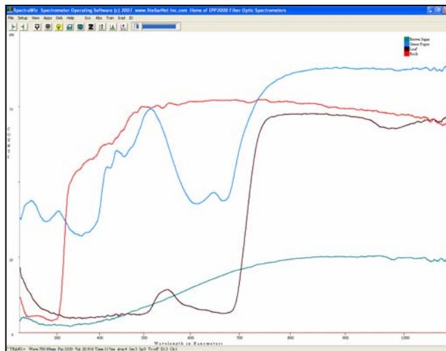
Paper, leaf, powder, and rock spectra obtained with the SL4-DT and concave grating spectrometer